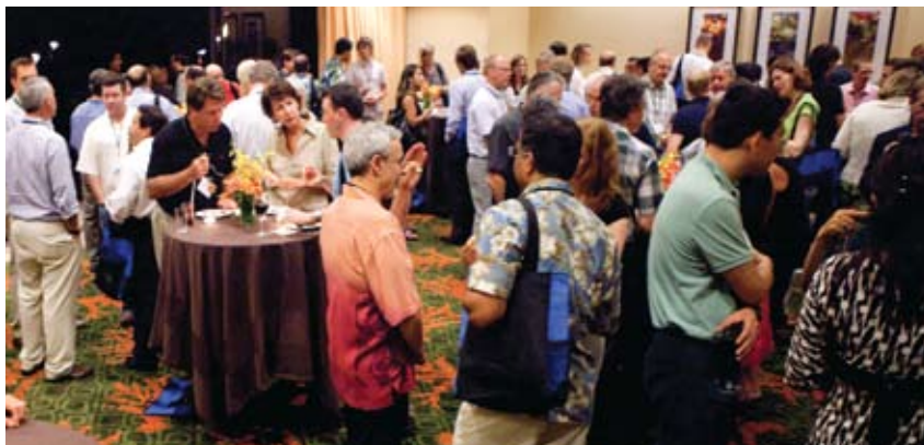
Attendees from around the world mingle at the 2009 Frontiers in Service Conference reception.

Over 200 business professionals and academics gathered in Hawai'i for the 18th annual Frontiers in Service Conference hosted by the Shidler College of Business.