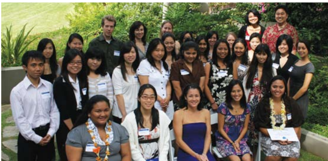
Smiling faces all around as the new members of the Beta Gamma Sigma International Honor Society gathered for a group photo.

This November, Shidler's brightest were welcomed into the exclusive international honor society Beta Gamma Sigma (BGS) at a special induction ceremony held in the Shidler College courtyard.