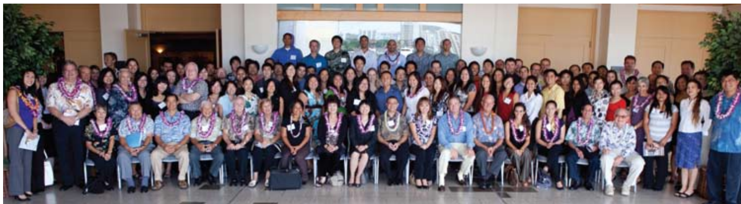
Grateful students had an opportunity to thank their scholarship donors at the College's annual Scholarship Luncheon held at the Japanese Cultural Center of Hawai'i.

Over $1.3 million in scholarships was awarded to 286 Shidler students in 2009-2010. Each year, student recipients are given a chance to meet and thank their donors personally at the College's annual Scholarship Luncheon. Close to 200 donors and recipients attended the special event at the Japanese Cultural Center of Hawai'i on November 9, 2009.