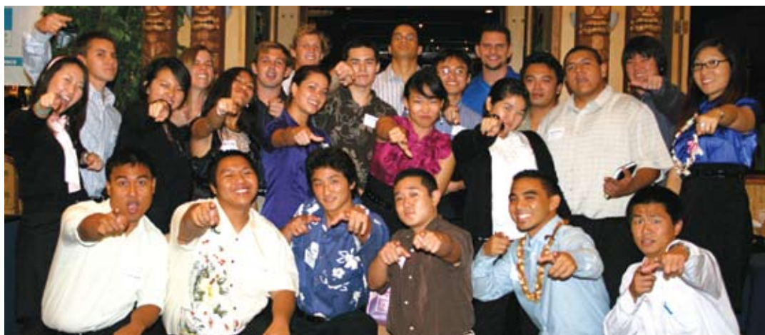
Entrepreneurs Club members strike a pose at their Mahalo Mixer held at Hukilau Restaurant in downtown Honolulu.

Three semesters ago, The Entrepreneurs Club was established with the purpose of “Entrepreneurial Empowerment.” The founding members wanted to form an organization where students could learn the fundamentals of entrepreneurship and were encouraged to explore their entrepreneurial spirit.