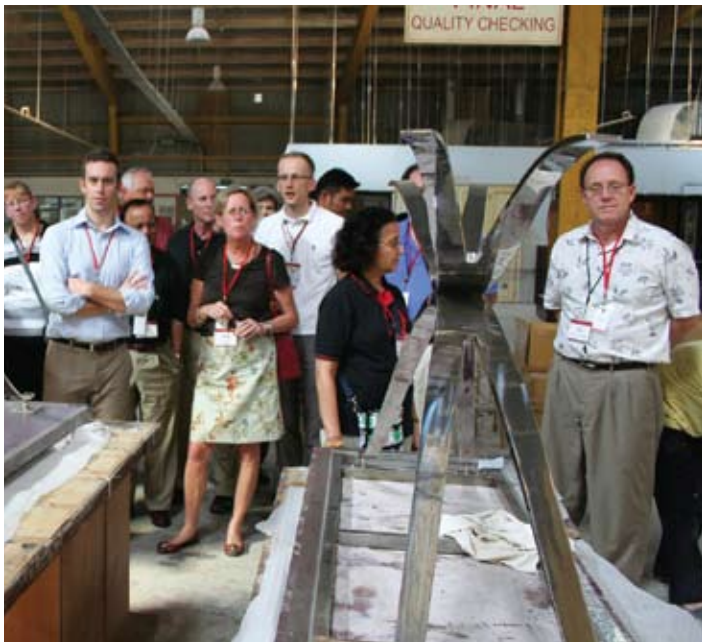
AA Corporation is the largest interior fit out company for 5-star hotels in Southeast Asia. The corporation's CEO provided a tour of the furniture manufacturing facilities.

The UH Center for International Business Education and Research (CIBER) coordinated the 2010 Vietnam Faculty Development in International Business. The program, which was co-hosted by the University of Wisconsin CIBER, was geared to help business school faculty learn the unique aspects of doing business in Vietnam. The first segment of the trip focused on Ho Chi Minh City's rapidly growing SME and MNE outsourcing and the second segment emphasized the transition of state-owned enterprises in Hanoi.