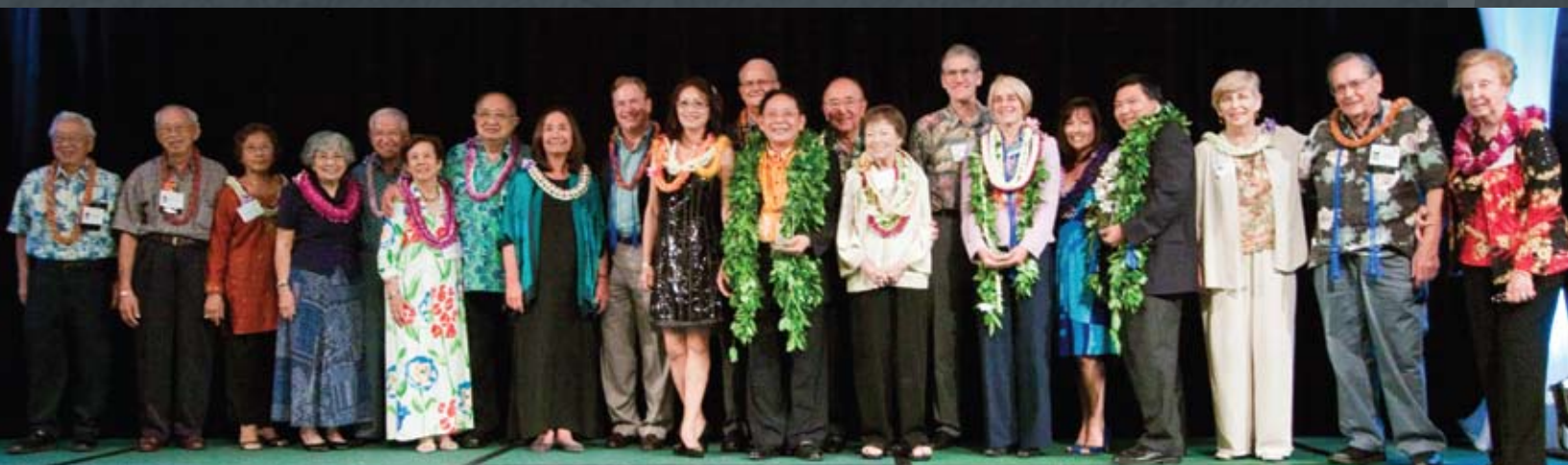
The 2009 Hall of Honor Award recipients are joined on stage by family and friends, as well as alumni from the classes of 1952 and 1953.

For more photos and videos from the 2009 Hall of Honor Awards, visit www.shidler60.com .