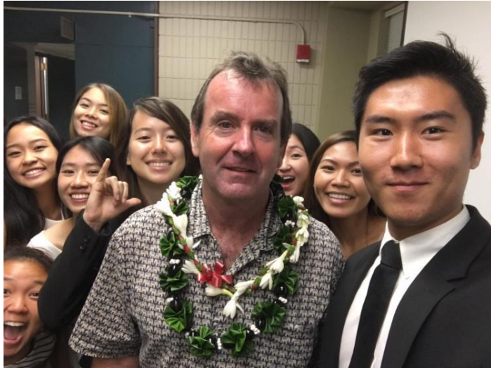
Picture from the Freeman Scholars Luncheon