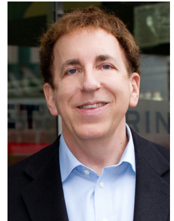
DEAN ORNISH, MD

Founder and President, Preventive Medicine Research Institute; Author, Dr. Dean Ornish's Program for Reversing Heart Disease Appearance via Skype