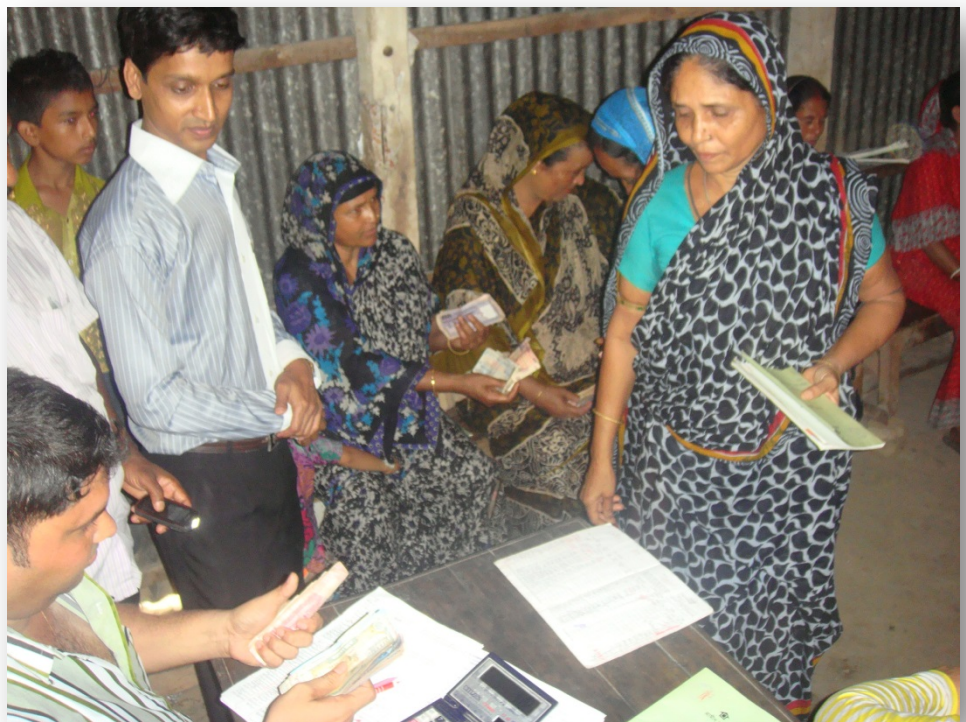
Figure 8. Grameen village center.

There are incentives in place to ensure that group members support each other in paying their loans back on time. After a loan is successfully paid off, the borrower is automatically eligible for a future loan of up to twice the original amount, an incentive that repeats itself with the successful payment of each successive loan. In the village, we met one woman who was on her eleventh loan. She used her initial loan of about $50USD to purchase a sewing machine so that she could sell clothes; her most recent loan was for about $15,000 USD, and she used it to purchase a small structure and additional sewing machines and textiles so that she could expand her business to include four hired seamstresses! This was extremely remarkable because of the fact that, only five years prior, she was homeless and living in poverty, and when we met her, she was a successful entrepreneur, and one of the most successful people in her village.