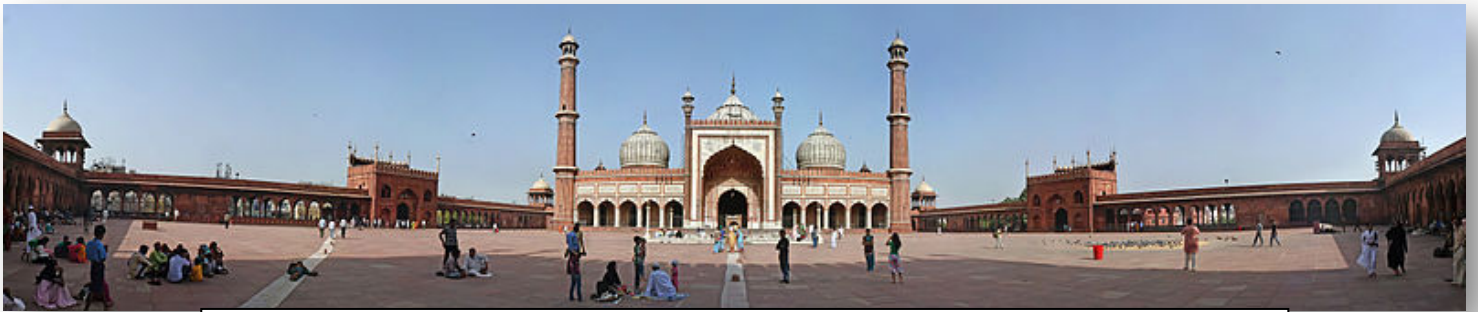
Figure 5. Jama Masjid

Also, because it was so dry, there was a constant haze that was present everywhere, and always. In fact, when I was at the India Gate taking a picture of it (figure 3), I was able to distinctly capture the air conditions in my photograph: although I was only a few hundred yards away from the monument at the time, you can distinctly tell that the monument looks hazy and far off in the distance. That's how the air was the whole time I was there in Delhi.