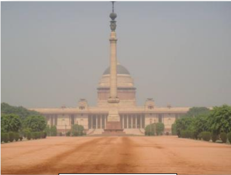
Figure 1. Presidential Palace