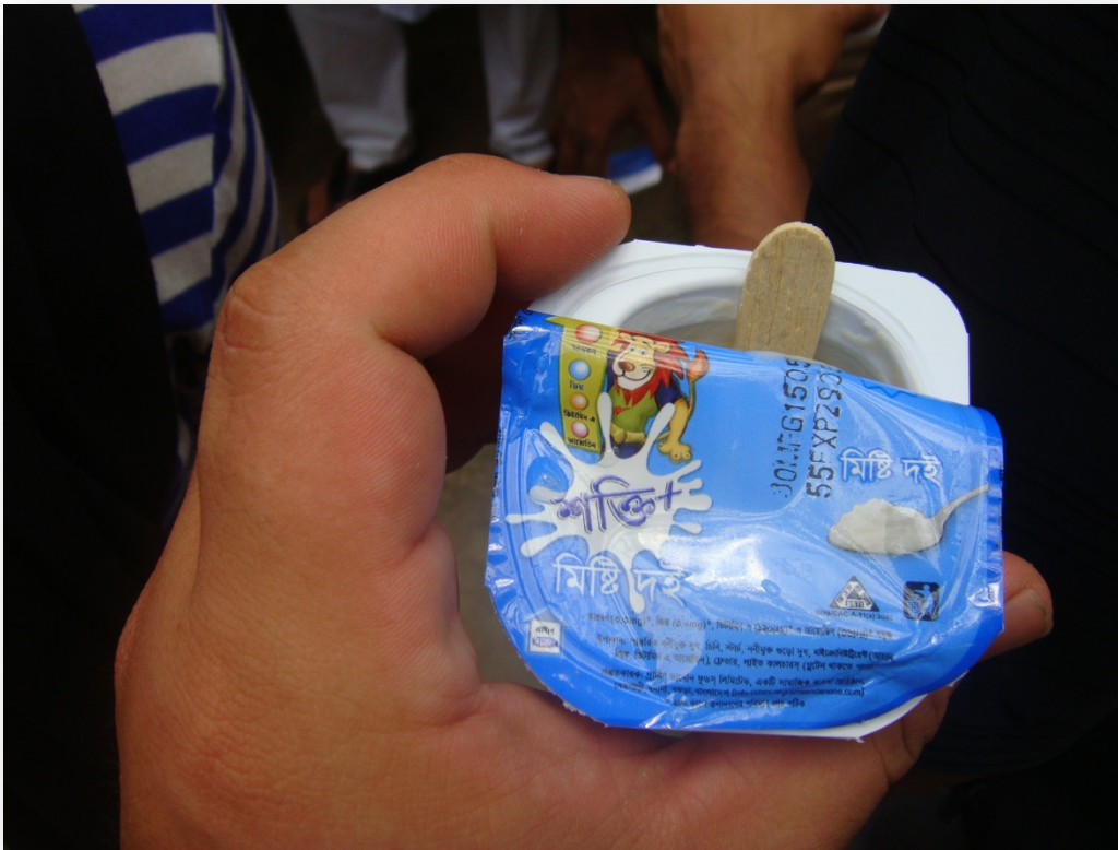
Figure 9. Grameen Danone yogurt.

Throughout the week, we visited numerous other places. We visited a milk collection and processing plant run by Grameen Danone. Grameen Danone is a partnership between Grameen and the Danone Group, which produces and markets Dannon yogurt in the US. Grameen Danone Foods is a social business enterprise which purchases milk from local farmers at fair value, and uses the milk to produce vitamin-fortified yogurt to the children of rural villages in Bangladesh