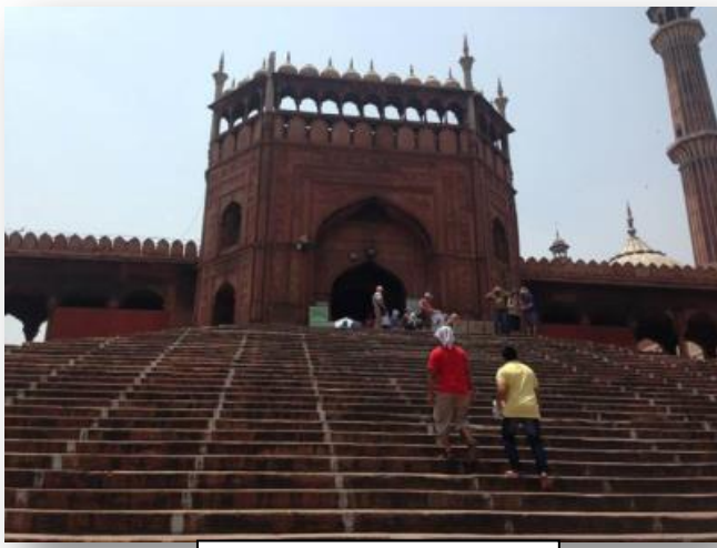
Figure 4. Jama Masjid

clothes were more or less dry, as the sweat was evaporating right off of my clothes into the air.