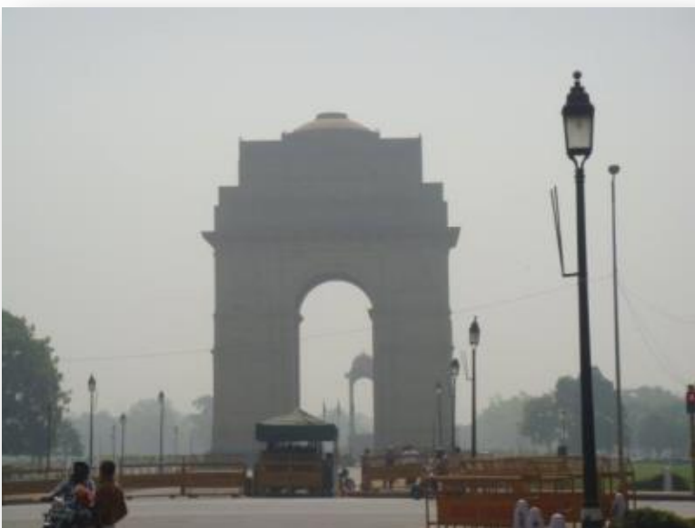
Figure 3. India Gate

First, we went to see the political district of Delhi. I was able to visit the President's palace (figure 1), the Parliament building, and the Indian Army headquarters (figure 2). Afterwards, we drove past the India Gate (figure 3), which is India's national monument, and was inspired by the Arc de Triomphe in Paris. We accomplished all of this before noon and headed to a local restaurant where I had a lunch of garlic naan (flatbread) and mutton roganjosh (very, very, very spicy lamb stew with garlic and peppers). It was delicious, albeit possibly the spiciest thing I have ever eaten, and I went through two 1-liter bottles of water during lunch and immediately after.