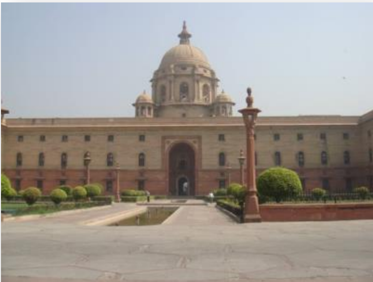
Figure 2. Indian Army Headquarters