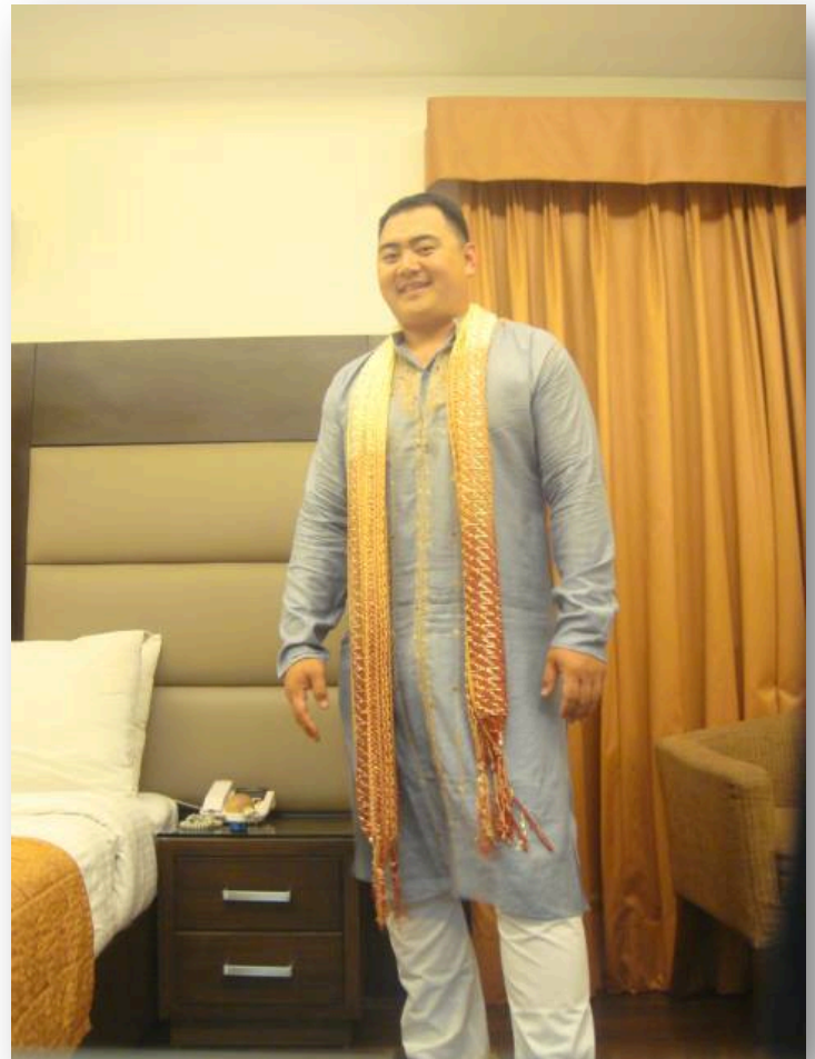
Figure 7. Indian Clothing.