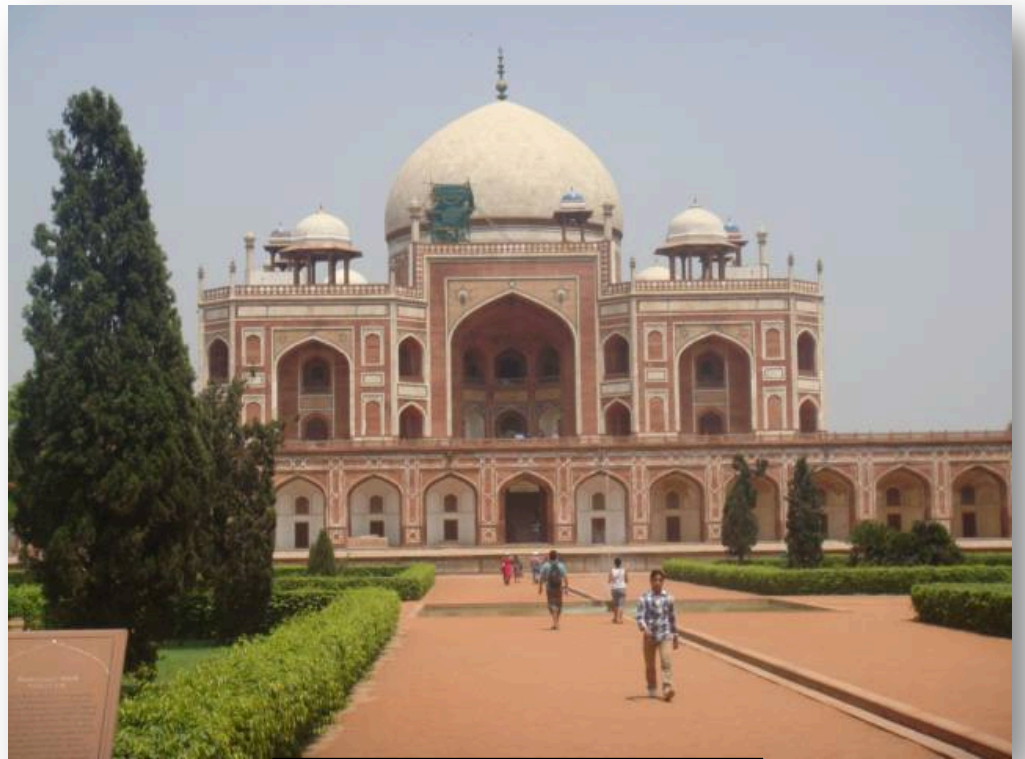
Figure 6. Humayun's Tomb

We made our way across the city and arrived at Humayun's tomb (Figure 6). Humayun's tomb is actually a complex of tombs, housed inside a large garden area, with the focal point of the entire area being the actual tomb of Humayun, the second Mughal Emperor, and ruler of northern India, Pakistan, and Afghanistan in the mid-16 th century. I was actually very happy to learn that the Taj Mahal, built in Agra some 60 years later, was architecturally inspired by Humayun's tomb. Both the Taj Mahal and Humayun's tomb are now UNESCO world heritage sites, and by visiting Humayun's tomb, I was able to see not just the central building but also the beautiful grounds and outlying buildings surrounding the monument.