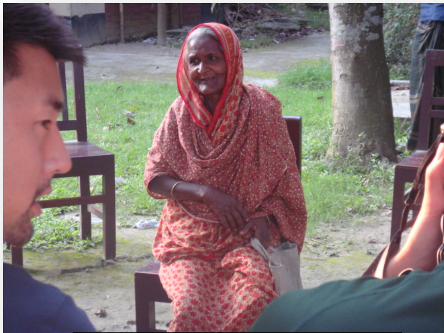
After an eventful week of business tours, site visits, and some sightseeing, I left Bangladesh with a deeper understanding of the world of microfinance and its potential to alleviate poverty. One of the questions that came up during one of the informational sessions that we attended was the effectiveness of the microfinance lending model in a more developed country, such as the United States. Interestingly enough, Grameen has already launched its US subsidiary, Grameen America, which has already established itself in cities such as New York, San Francisco, and Los